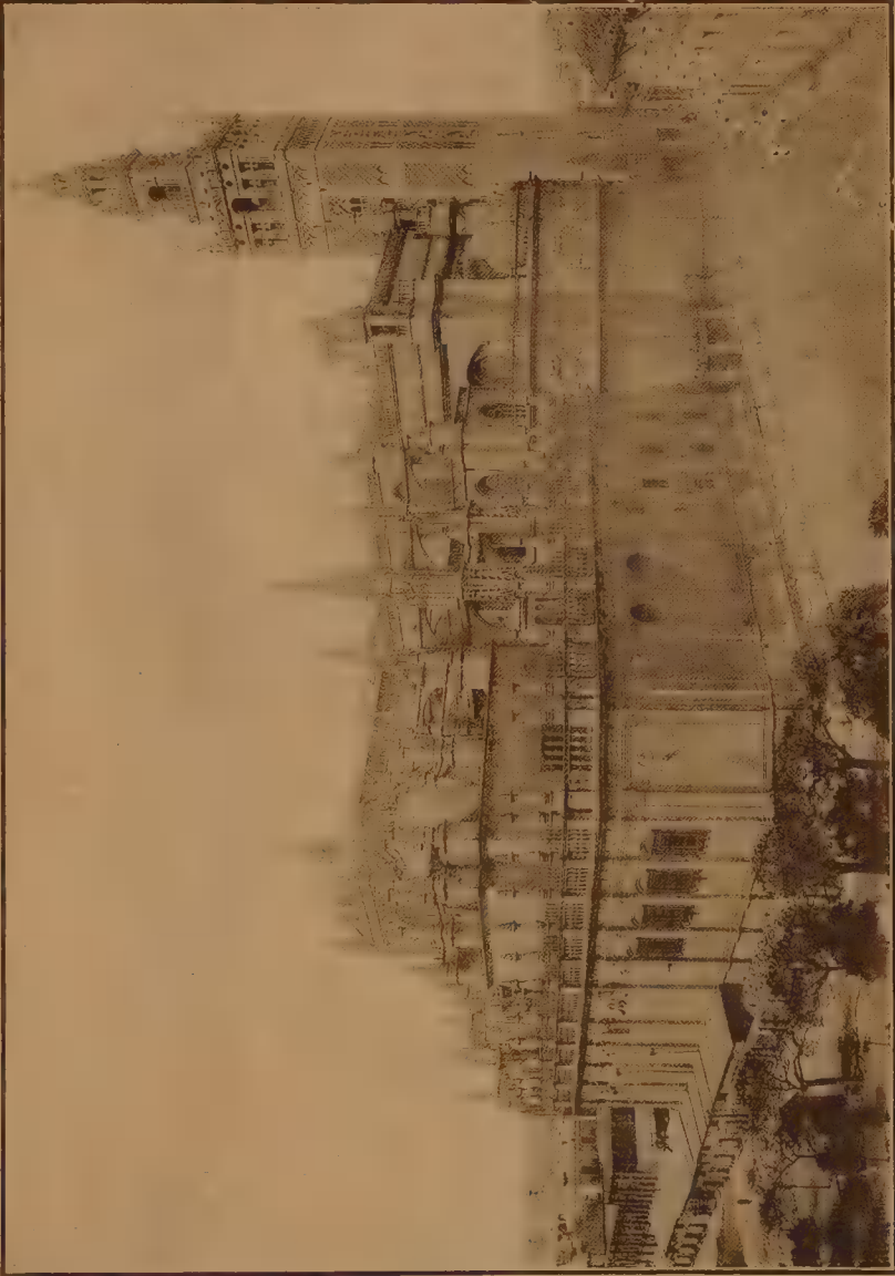
THE CATHEDRAL, SEVILLE